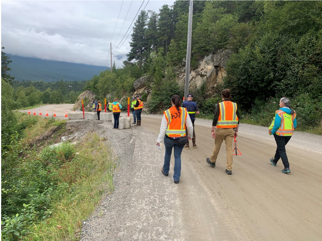
Project Team inspecting road damage/failure on Dyea Road