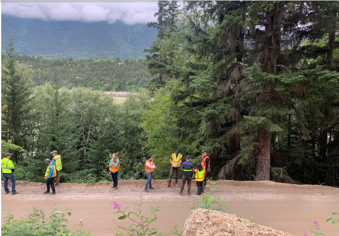
Project Team inspecting road damage on Dyea Road